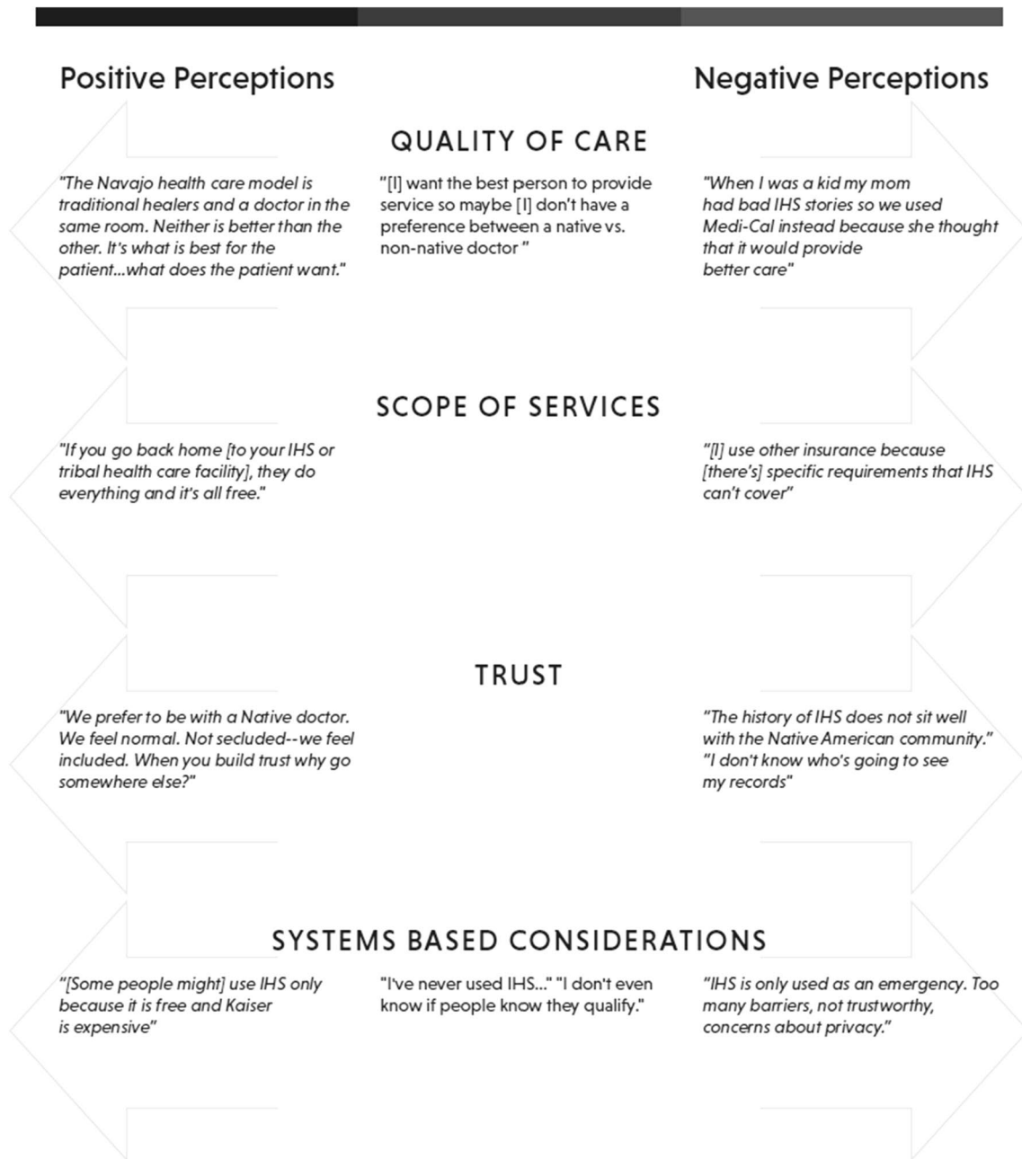
Fig. 1 Range of participant perceptions about the use of the Indian Health Service and Culturally-Specific Health Care

local providers, this again underscores the importance of having culturally appropriate care available and trauma-informed environments that people can go to address or alleviate these common problems and concerns.